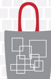
NON-CLEAR PRINTED / PATTERNED TOTES

ALSO PROHIBITED, BUT NOT PICTURED ABOVE: OUTSIDE FOOD OR DRINK, ANIMALS (EXCEPT SERVICE ANIMALS TO AID GUESTS WITH DISABILITIES), UMBRELLAS, ARTIFICIAL NOISEMAKERS, BEACH BALLS OR INFLATABLES, LASER POINTERS, BABY SEATS OR STROLLERS, LAWN CHAIRS, FOLDING CHAIRS, STOOLS, ICE CHESTS, COOLERS, OR THERMOSES, WEAPONS OF ANY TYPE, VIDEO CAMERAS, AND ANY BAG WHICH EXCEEDS 12" X 12" X 6"