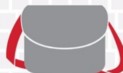
CAMERA BAGS / BINOCULAR CASES