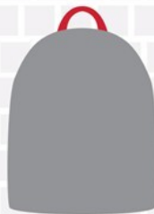
BACKPACKS / BRIEFCASES